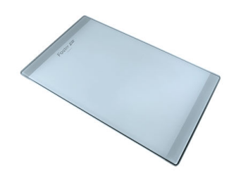
Class chopping board 8631 300