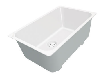
White bowl 8153 100